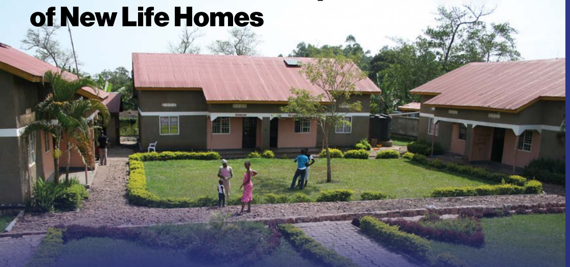
The New Life Homes is a refuge for vulnerable boys, offering safety, stability, and hope. Through education and care, these children now have the chance to thrive. Celebrate their journeys and the impact of New Life Homes as we work toward brighter futures, one child at a time.

The Transformative Impact of New Life Homes